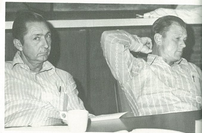
Legislating is a pain in the neck!