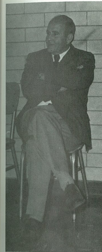
He's dancing with my girl!